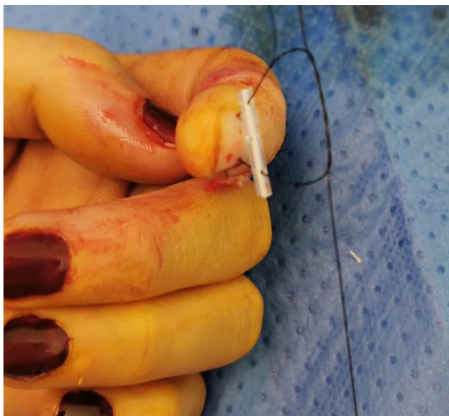
Figure 5. Passing the Nylon sutures into the plastic tube at two different holes and double non-locking knot of Nylon suture.

holes to form a gutter. Here, a non-locking double knot is made and gently tightened or released in the gutter until obtaining the optimal tendon tension [Figure 5]. The goal is to obtain a physiological digital flexion cascade when the wrist is in extension and a complete extension of the injured finger when the wrist is in flexion [Figure 6]. Once good tension is obtained, several locking knots are made, and the stability of the fixation is checked.