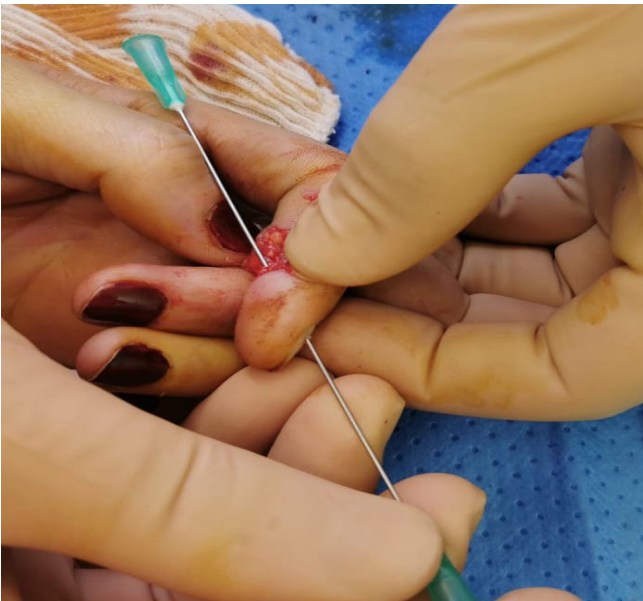
Figure 2. The second needle is pushed on the tip of the first needle and replaces the first needle.

As a result, each nylon suture thread is attached to the