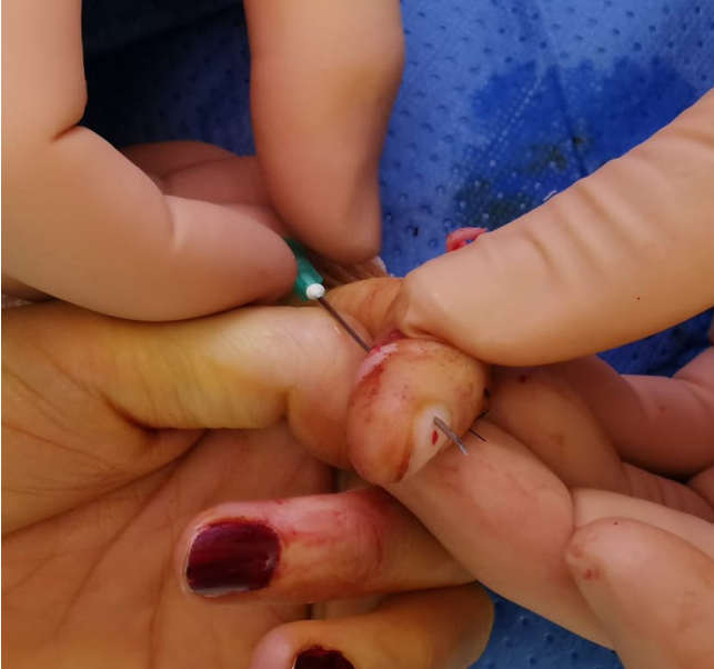
Figure 1. Needle is passed through tendon remnants along the side of the distal phalanx and exits through the nail plate, not engaging the nail folds.

tip of the tendon, and the needle of the nylon suture is then cut. The same trajectory sequence of a 21-gauge hypodermic needle is used at the other side of the distal phalanx, and the other end of the nylon suture thread is passed through the needle from volar to dorsal, providing a second fixing point [Figure 4].