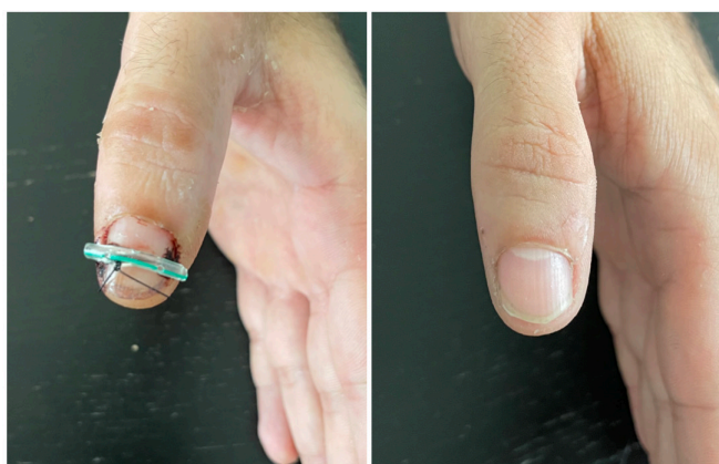
Figure 7. Three weeks after surgery of pull-out suture fixation. The same patient at nine months of follow-up with a normal nail.